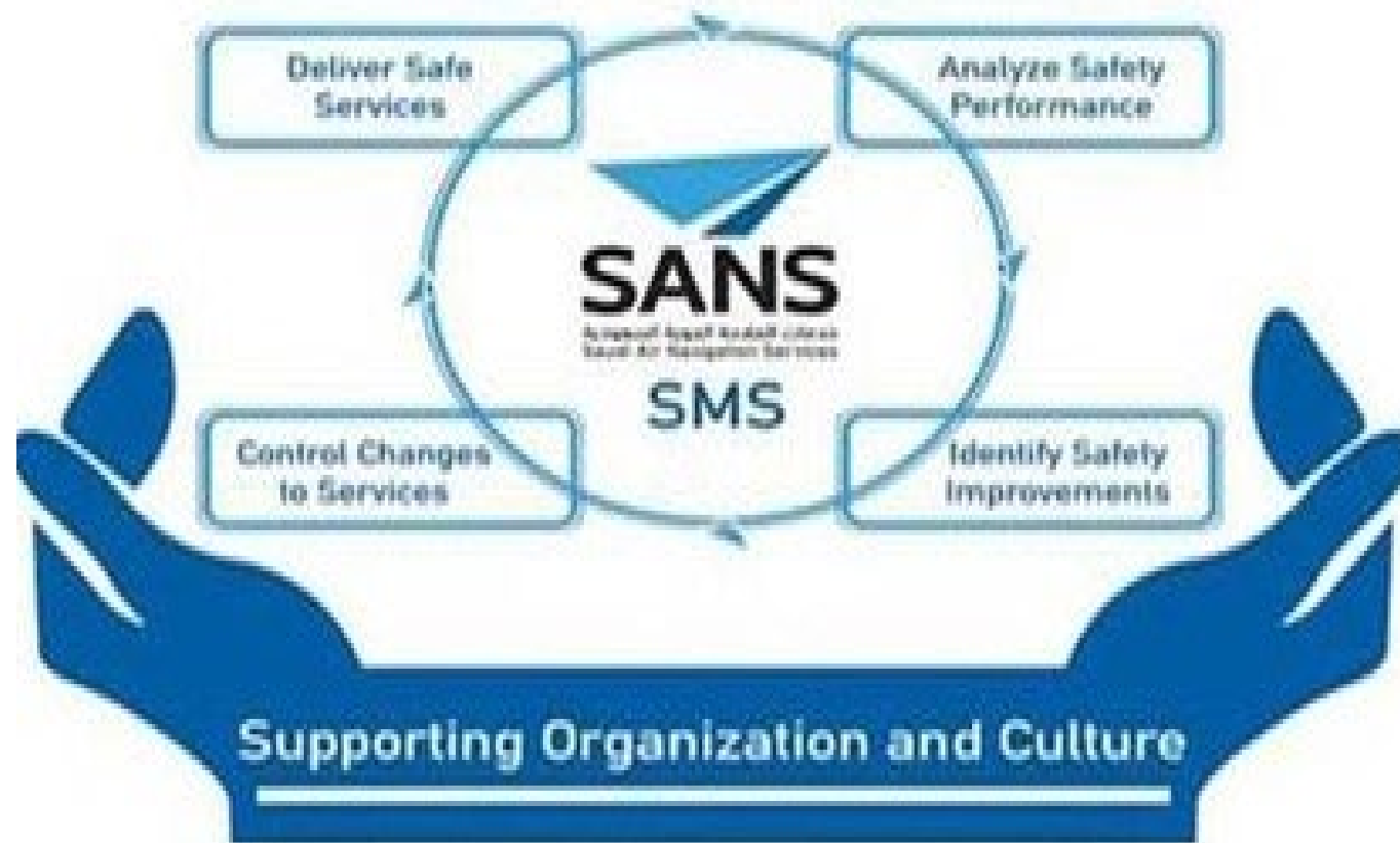
Saudi Air Navigation Services (Saudi Arabia) (Presented at CANSO SSC Conference (2018))